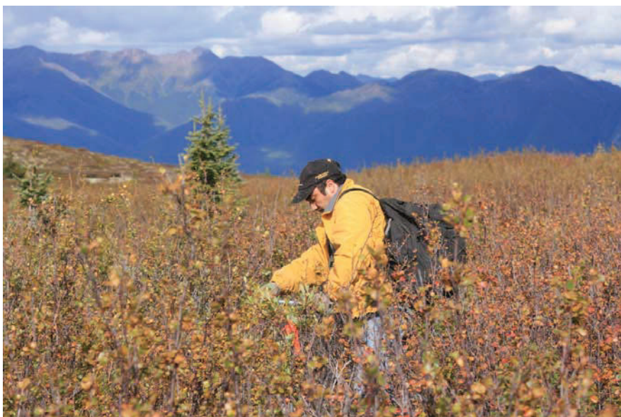
Figure 4. Soil sampling at the Yukon Base Metal Project

Work is well advanced on the technical, economic and environmental components of mine permitting. Throughout 2011 the Company continued to advance the data collection and conduct environmental tests to be in a position to provide adequate information to regulators upon mine permit application.