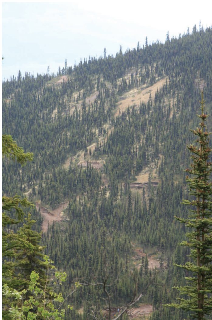
Figure 4. Drill pads at the Darcy Zinc Deposit, Yukon Territory, Canada