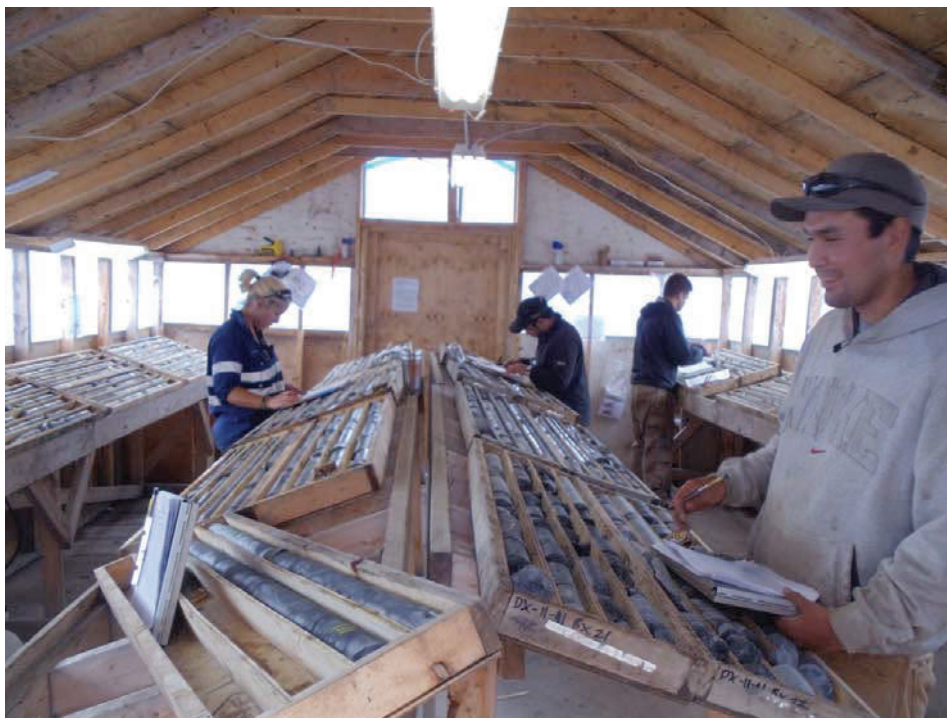
Figure 3. Overland's Geologists and Technicians in the Company's camp core logging facility