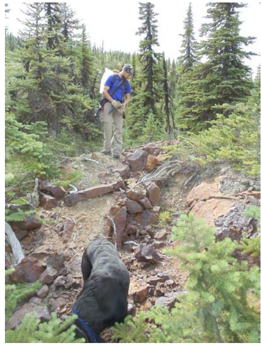
Figures 2 and 3. Massive sulphide occurrences identified at the Riddell Prospect 20km south east of the Andrew Zinc Deposit